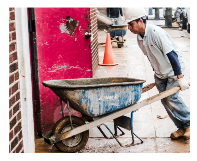
THE MAYCROFT RENOVATION