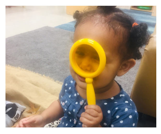
A STUDENT IN HEALTHY START

By year-end, Jubilee was well on its way to creating 64 deeply affordable homes with onsite or nearby supportive services in the thriving Columbia Heights neighborhood.