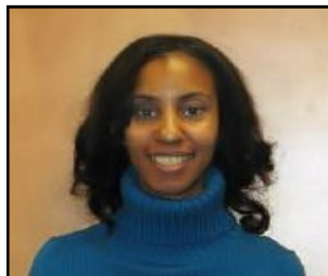
Welcome, new neighbor!