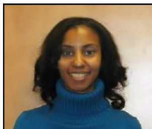
Welcome, new neighbor!